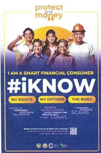
Figure 2.1: PYM Digital Poster Portrait version