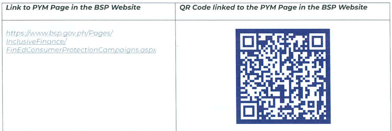
Table 1: Downloadable link and QR code for PYM Materials in the BSP Website

For clarifications, please contact the FSF's Consumer Protection and Education Committee at cpecsecretariat@bsp.gov.ph .