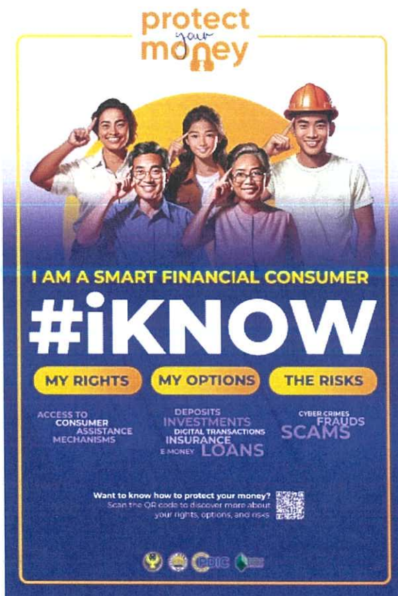
Figure 1: PYM Printed Poster